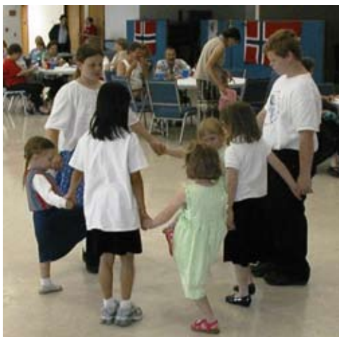
OKCIFD Scandanavian dances