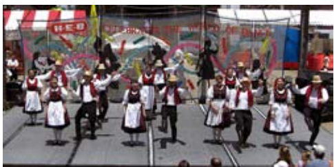
Csardas Hungarian Dancers, See the report on their activities in the July eLetter.